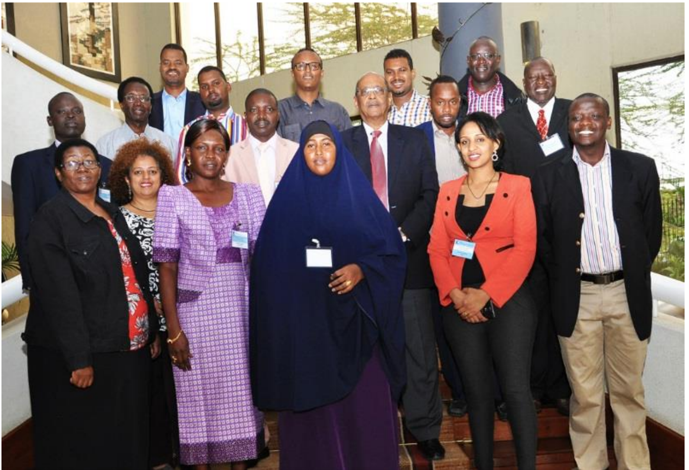
Participants at the Training

31 st MAY to 3 rd JUNE 2016, OLE SERENI Hotel-NAIROBI, Kenya